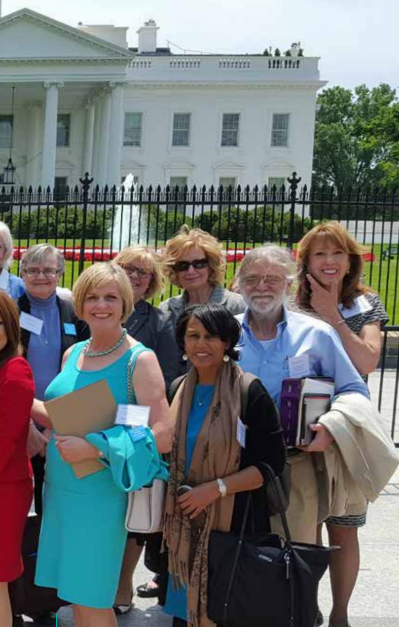
Alliance of Nurses for Health Environments. Nurses meet with the Obama Administration in 2016 to address nursing's contribution to mitigating the effects of climate change.