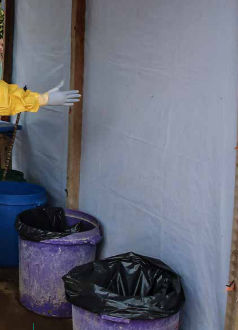
Ebola response in Mangina, Democratic Republic of Congo.