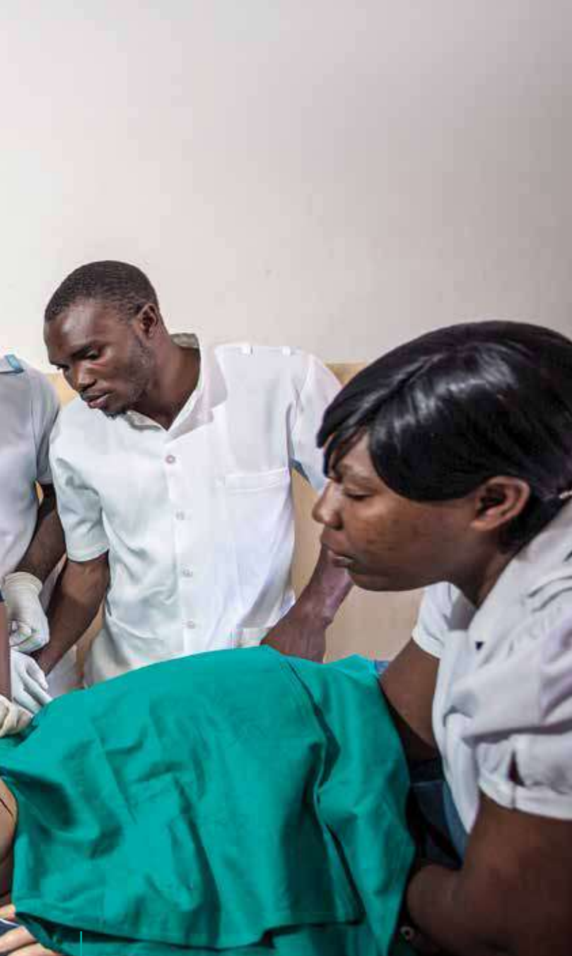
ICAP. The Global Nurse Capacity building Program works to strengthen the quantity and quality of the nursing and midwifery workforce in sub-Saharan Africa.

ICN strongly encourages health systems and countries around the world to place a high value on the education of their nursing staff. Investment in nursing education will further drive the health system to deliver care that individuals and communities need by i) improving knowledge and competence; ii) increasing confidence in clinical and leadership skills, critical thinking and decision making; and iii) increasing job satisfaction and retention. Such investment will be a great catalyst for positive transformation.