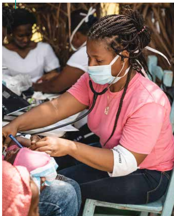
Earthquake Response – Haiti.

A referendum was held in Switzerland in 2021 to address the country’s nurses’ working conditions. As a result of a positive vote, nurses will be supported with better pay, education and working conditions. This public show of support recognises the valuable contribution of nurses and demonstrates its commitment to putting their support into action.