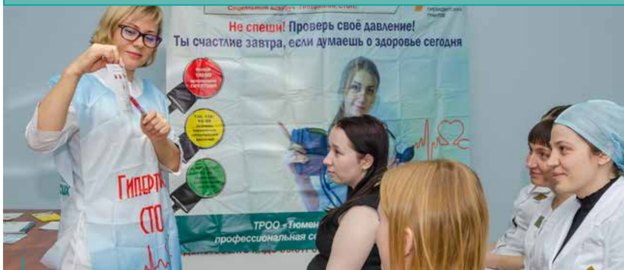
Tyumen Regional Nurses Association, Russia.